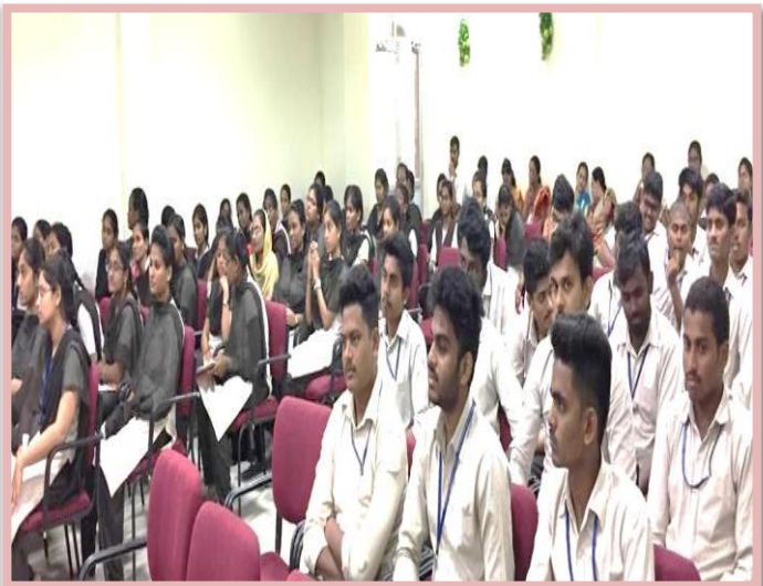
Students present in Guest Lecture